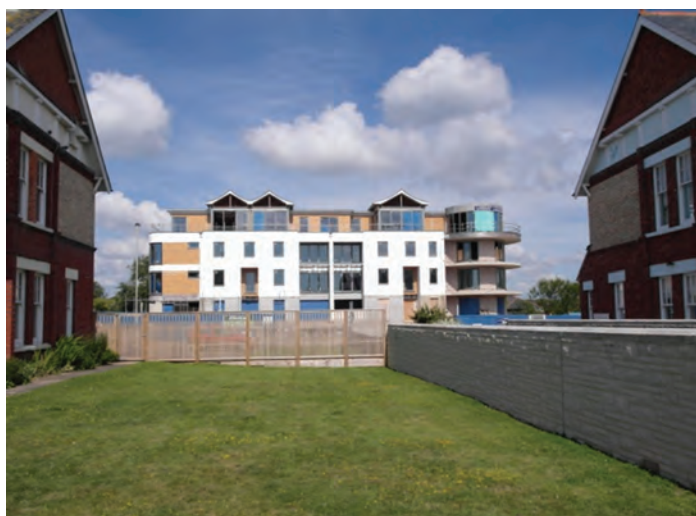
Figure 2 Photographs taken around Weymouth, Dorset: a growing settlement on the south coast of England.