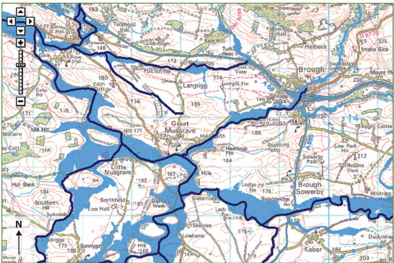
B. Environment Agency GIS flood risk map.