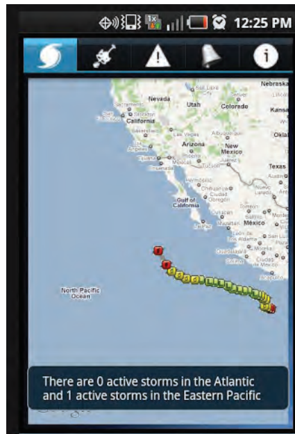
Figure 1 A. Smart phone 'application' (app) for tracking hurricanes.